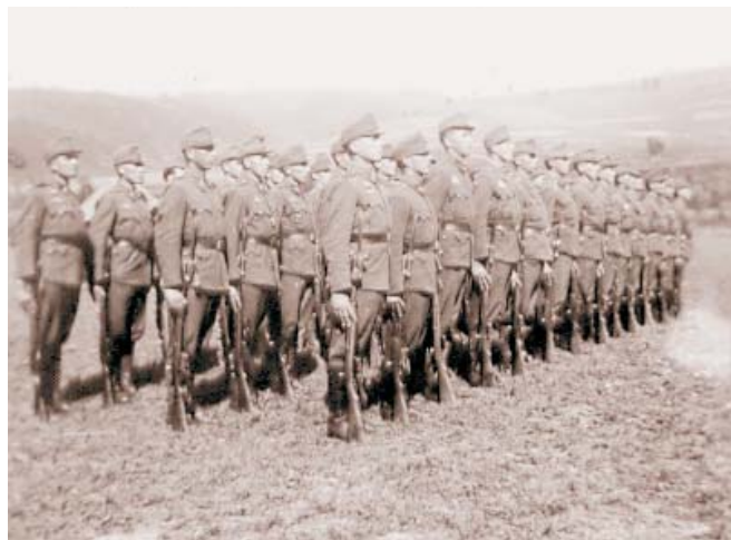
Székelly határőr egység

On March 19, 1944., his division moved to the front line in Gyimes. In August of 1944 the Soviet military attacked the position, and after an unexpected move of the German army, they were cut off from their supplies and ended up in a hopeless position, which they eventually managed to get out of.